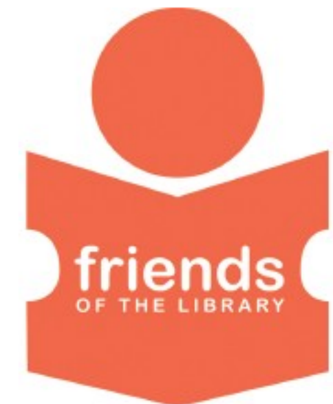
The mind and heart of the community™

Friends of the Library of Collier County has confirmed four bestselling authors for its 2015 Nonfiction Author Breakfast lectures. Authors and dates are: